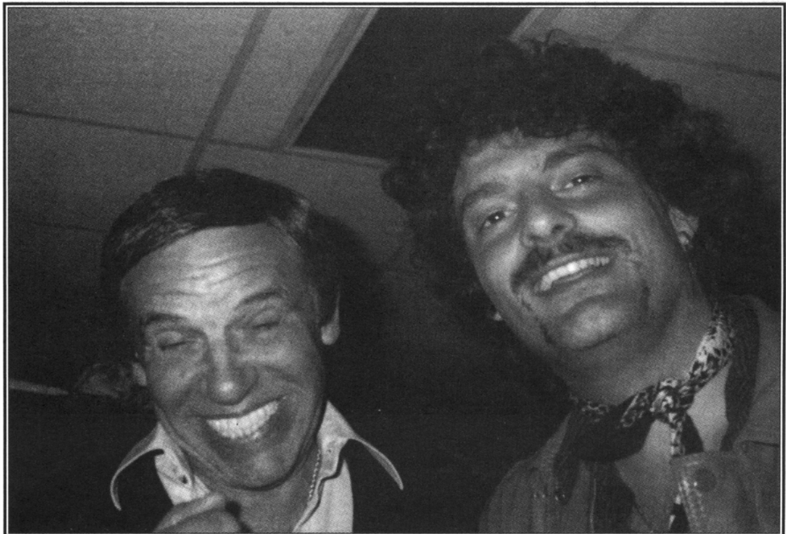
Carmine with drum legend Buddy Rich